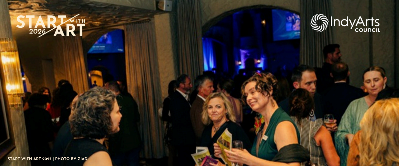
START WITH ART 2025 | PHOTO BY ZIAD