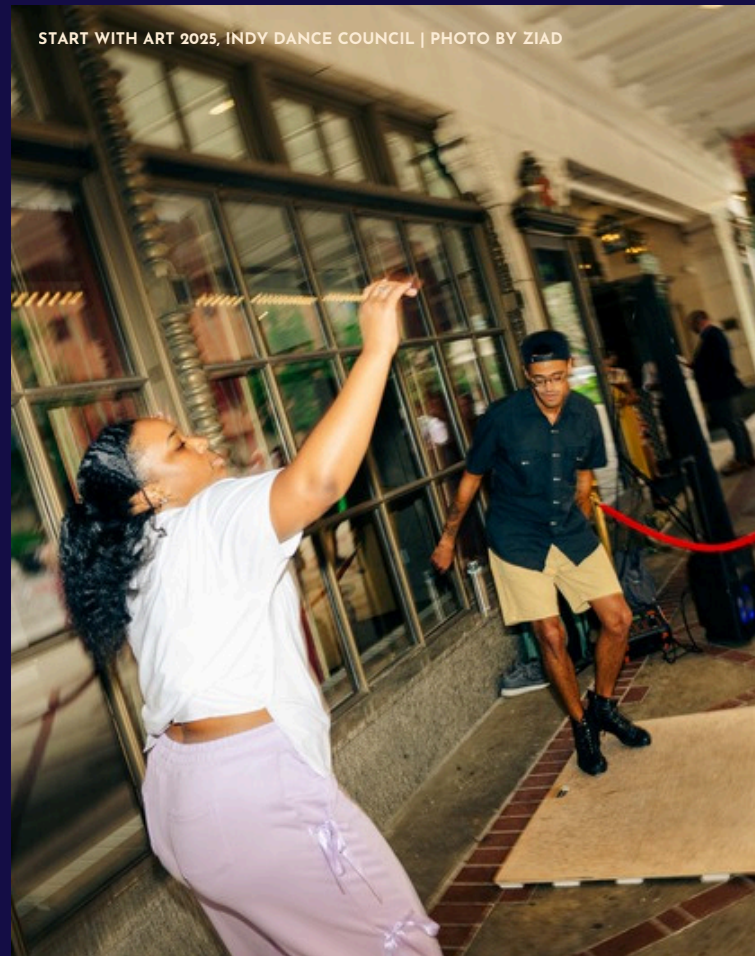
START WITH ART 2025, INDY DANCE COUNCIL