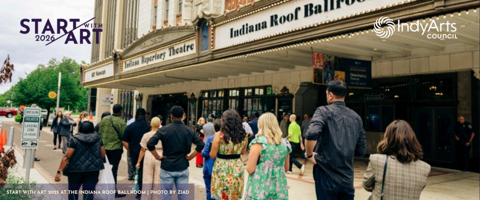
START WITH ART 2025 AT THE INDIANA ROOF BALLROOM