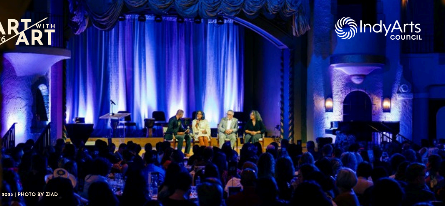
START WITH ART 2025