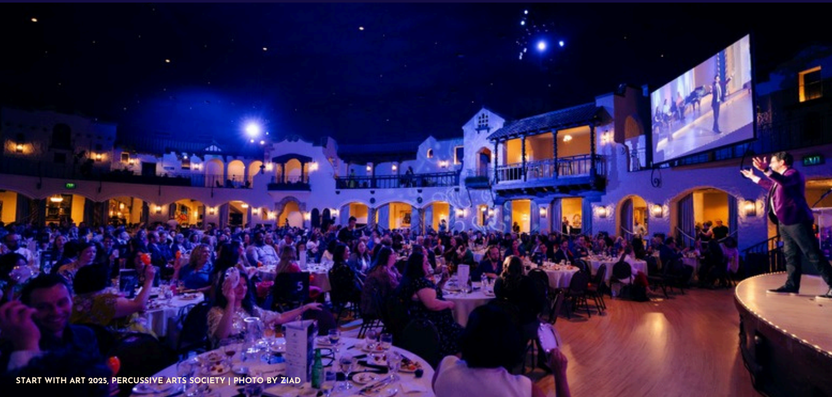
START WITH ART 2025, PERCUSSIVE ARTS SOCIETY | PHOTO BY ZIAD

Nearly 1,000 arts, business, and community leaders gather to support the Indy Arts Council's mission to champion arts and culture and realize our vision of a creative life for all in Indianapolis.