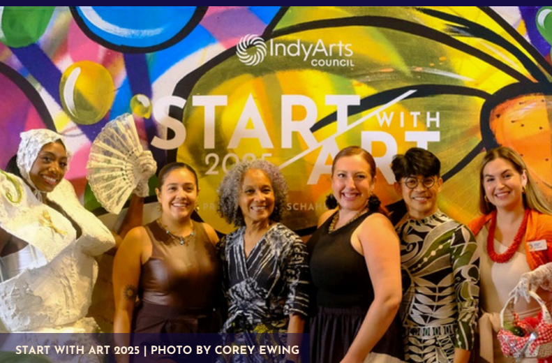
START WITH ART 2025 | PHOTO BY COREY EWING